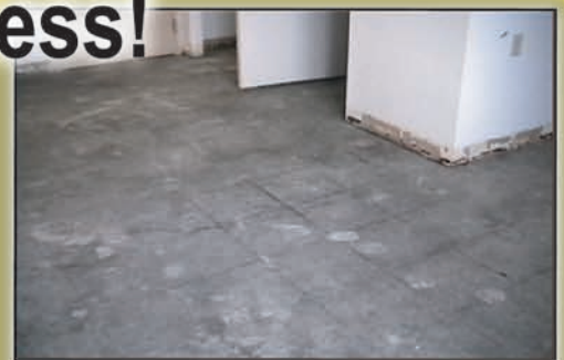
Ready to Resurface!