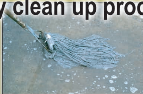
Mop with Emerge™