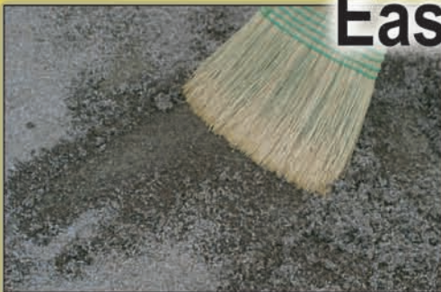
Absorb with Commercial Absorbent