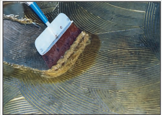
Remove carpet and tile mastics!