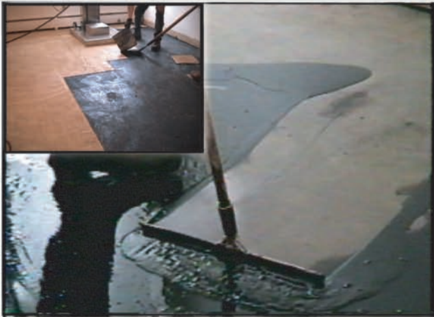
Remove asbestos mastic!

Made from 100% American Grown Soybeans Safe Environmentally Friendly Mastic Remover