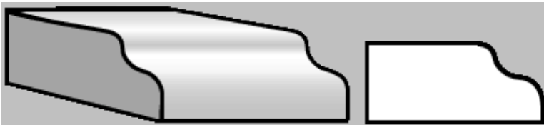
OGEE Grinder Profiling Bit