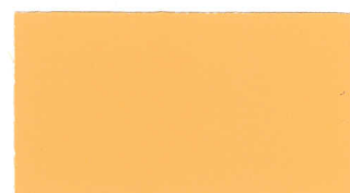
MUSTARD BUFF ADD 3 BAGS OF BUFF TO 1 YARD