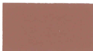
HICKORY BARK ADD 2 BAGS OF BARK TO 1 YARD