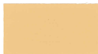
HONEY BUFF ADD 1 BAG OF BUFF TO 1 YARD